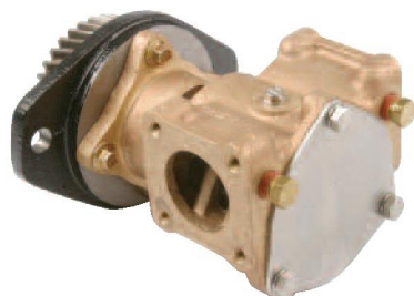
P1727X, P1727A, P1730X, P1730A, P1731, and P1733X