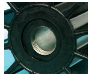
Threaded Impellers (17000 and 27000)