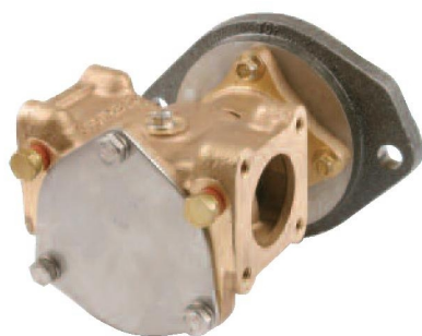
P1710X, P1710A, P1726X, P1732X & P1732A