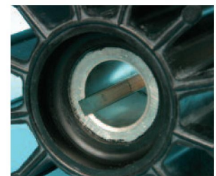
Thru-Key Design Impellers (17000C)