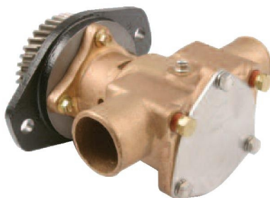
P1716X, P1722X, & P173